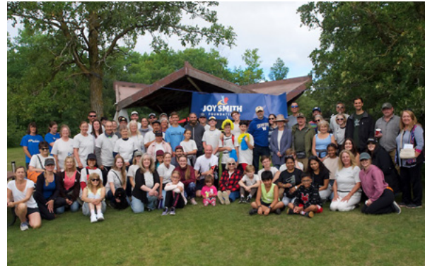
Thank you to Pine Ridge Church for your leadership with our Joy In Action Birds Hill event.

This year's event wrapped up on September 30th. It demonstrated how it transcends mere fundraising; it's a collective effort to raise awareness, ignite discussions, and inspire action within our community.