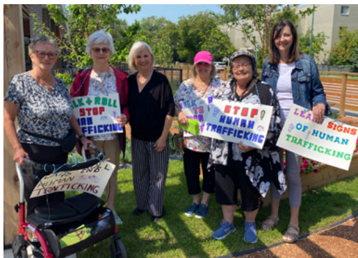
We had such a great time with the residents of The Melody Retirement Residence who held a "Walk and Roll" event in support of Joy in Action!