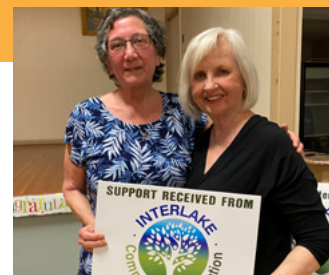
Thank you to the Interlake Foundation for their continued support of our Prevention and Intervention programs! Your unwavering commitment to helping individuals affected by human trafficking in our neighbourhoods is beyond amazing!