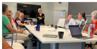
Educating service providers on how to help victims.