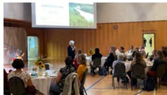
Presenting to the NKMB Mom's Group to educate the moms.