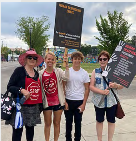
This team had a great time in Edmonton raising awareness about human trafficking in Canada.