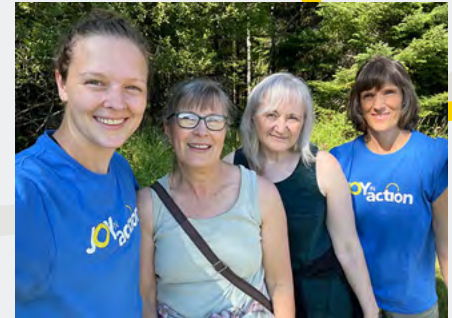
Team Freedom Pedalers got to enjoy some beautiful weather and scenery in Ontario for their Joy in Action 5K walk and 50K bike ride!