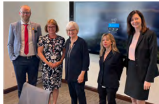
Meeting with the All Party Parliamentary Group to End Modern Slavery.