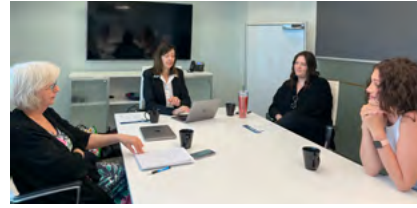
Meeting with survivors to develop survivor-led programs.

With your help, we can expand our Intervention programs to support survivors and their families. Your donation directly empowers each survivor to get the necessary resources and tools they need to heal and rebuild their lives.