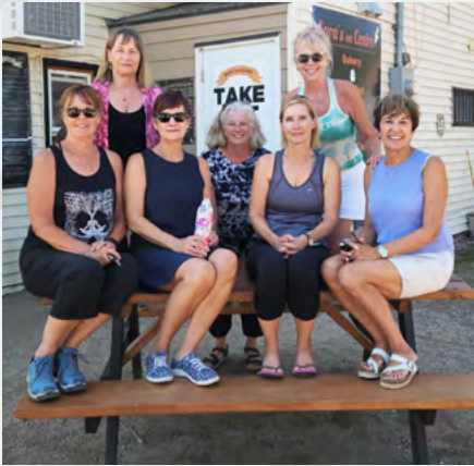
Team Walking for Joy had a great time with Joy in Action!