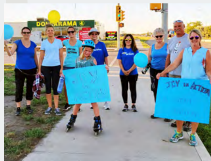
Team Joy's Freedom Fighters decked themselves out in blue and yellow to do their walk in Saskatchewan.