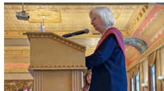
Giving greetings at the Infinity Women Secretariat 10th Annual General Assembly.