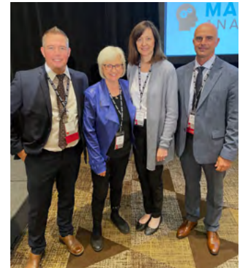
At the Canadian Association of Chiefs of Police National Human Trafficking Symposium in Toronto.