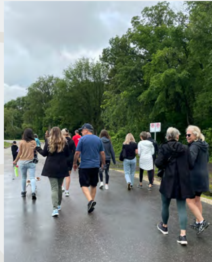
Team Walking for Change decided to walk despite some rainy weather—what troopers!