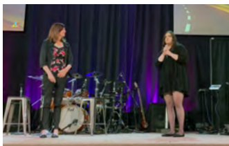
Speaking at Bethel Christian Assembly in Brandon, MB to share the facts of human trafficking and how to prevent it from occurring in the community.