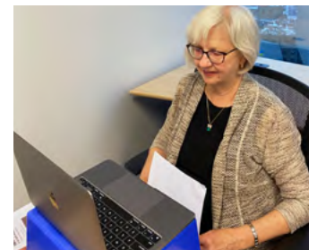
Presenting to the International Women's Mental Health virtual webinar put on by the World Federation for Mental Health.