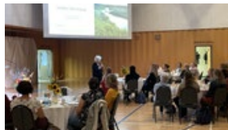
Presenting to the NKMB Mom's Group to educate the moms.