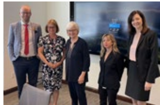
Meeting with the All Party Parliamentary Group to End Modern Slavery.