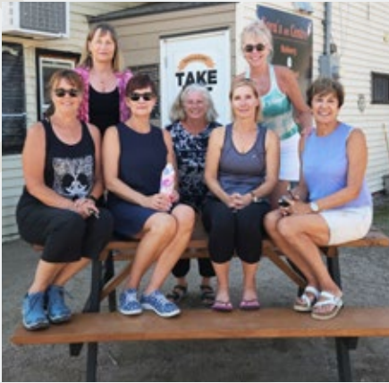
Team Walking for Joy had a great time with Joy in Action!