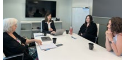
Meeting with survivors to develop survivor-led programs.

With your help, we can expand our Intervention programs to support survivors and their families. Your donation directly empowers each survivor to get the necessary resources and tools they need to heal and rebuild their lives.