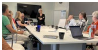
Educating service providers on how to help victims.