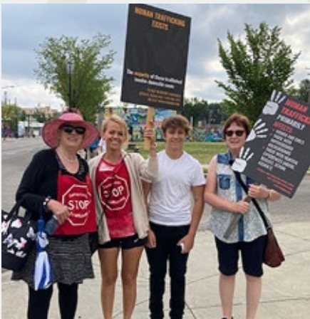
This team had a great time in Edmonton raising awareness about human trafficking in Canada.