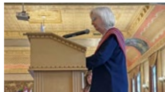
Giving greetings at the Infinity Women Secretariat 10th Annual General Assembly.