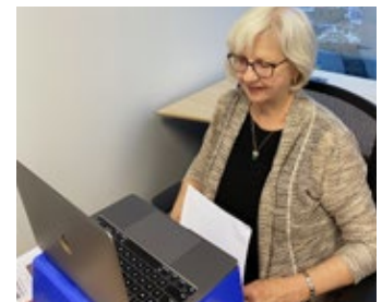
Presenting to the International Women's Mental Health virtual webinar put on by the World Federation for Mental Health.