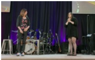
Speaking at Bethel Christian Assembly in Brandon, MB to share the facts of human trafficking and how to prevent it from occurring in the community.