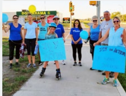
Team Joy's Freedom Fighters decked themselves out in blue and yellow to do their walk in Saskatchewan.