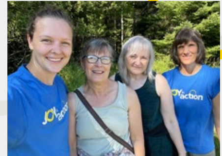
Team Freedom Pedalers got to enjoy some beautiful weather and scenery in Ontario for their Joy in Action 5K walk and 50K bike ride!