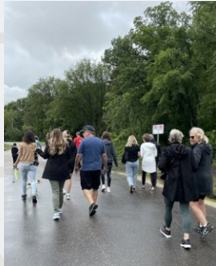
Team Walking for Change decided to walk despite some rainy weather—what troopers!